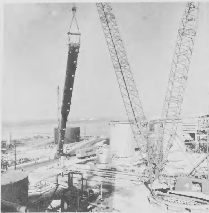
Sitting on the Ringer which allows 360 degrees rotation, the Manitowoc Crane slowly lifts tower for Hydrogen Plant.

Coloca ariba e Ringer cual ta permiti rotacion di 360 grados, e grua Manitowoc lentamente ta hiza columna pa Planta Hidrogeno.